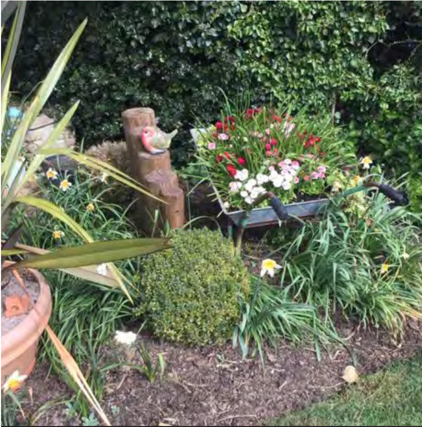
Biggest Robin in Buckinghamshire!