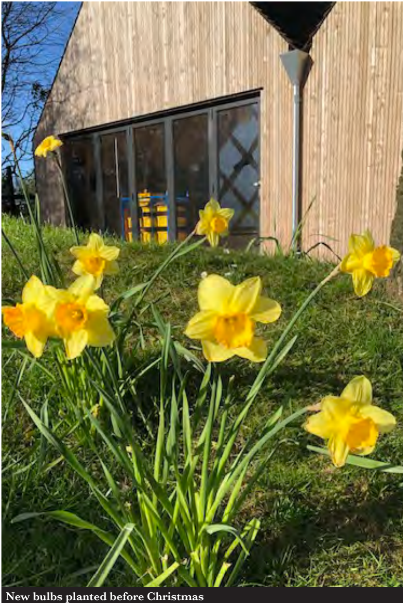
New bulbs planted before Christmas