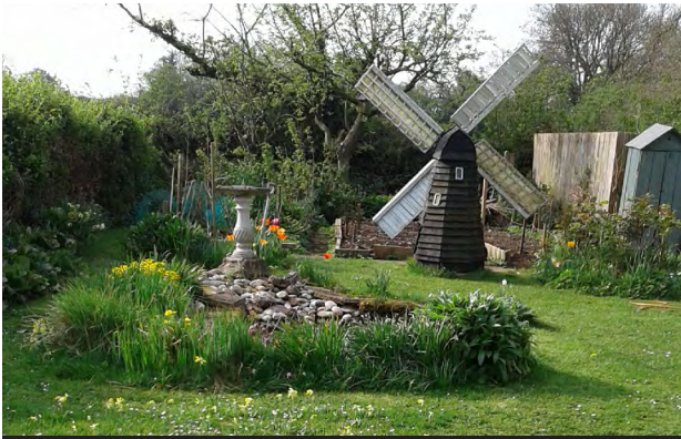
Spring flowers around a windmill