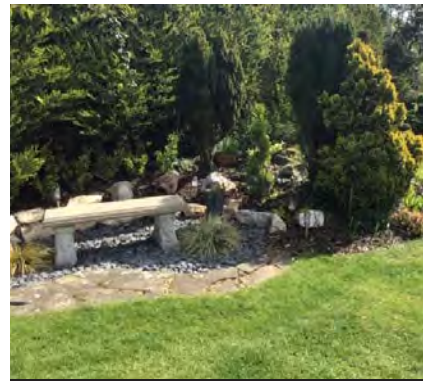
Best seat in the house