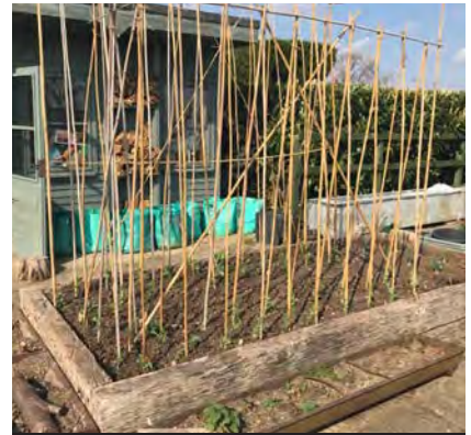
Sweet peas up