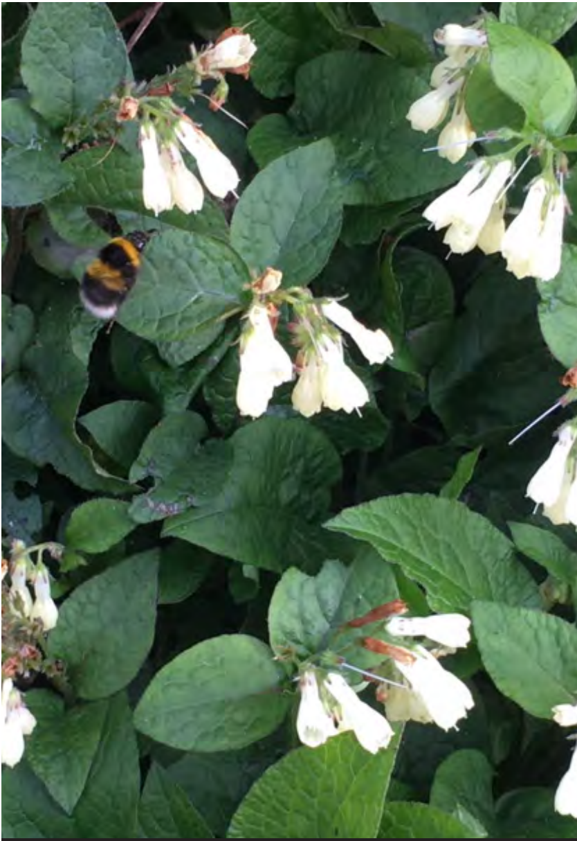
Bees loving the Comfrey