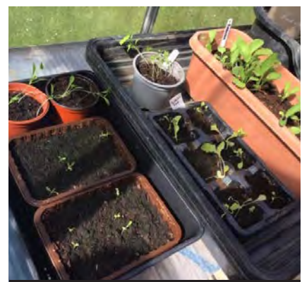
Seedlings loving this weather