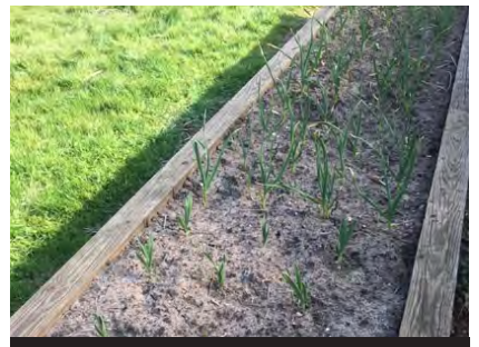
Garlic growing well