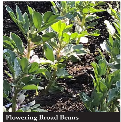
Flowering Broad Beans