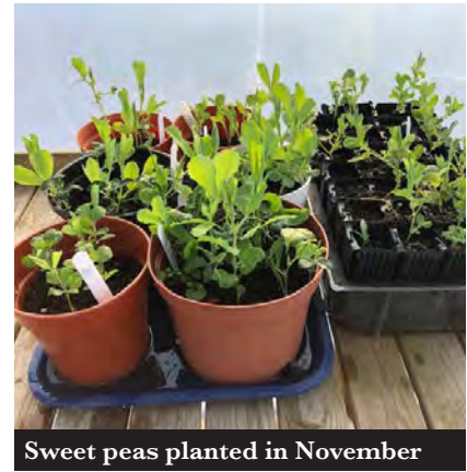
Sweet peas planted in November