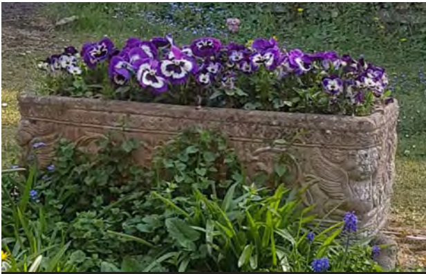
Perfect Purple Pansies