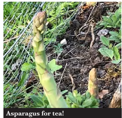
Asparagus for tea!