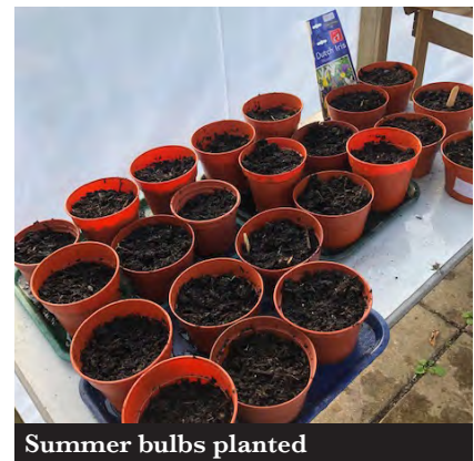
Summer bulbs planted