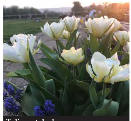
Tulips at dusk